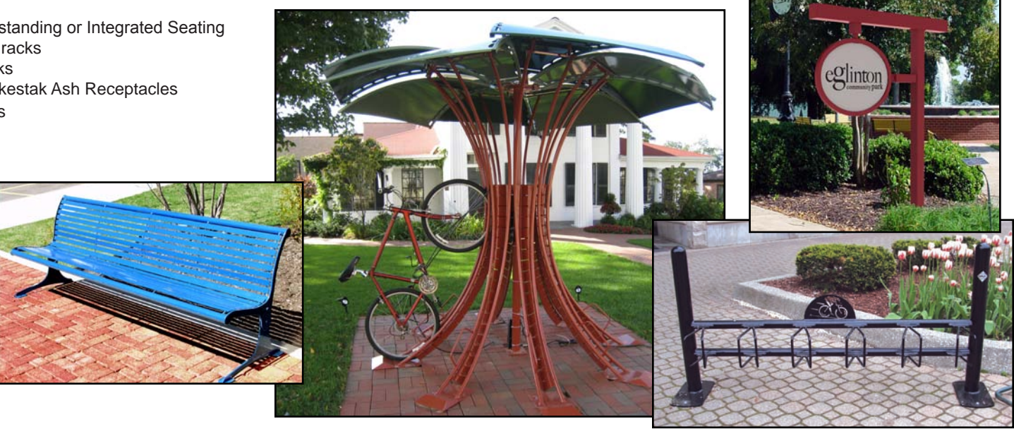
Contact us with your next project idea and we'll create the perfect shelter for your site.